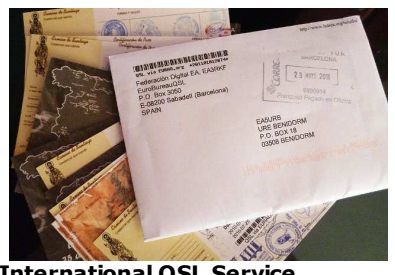
International QSL Service.