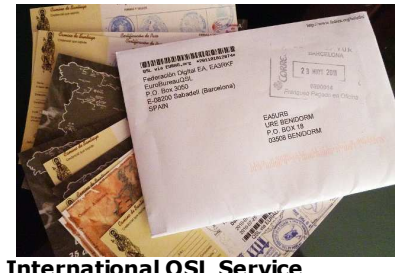
International QSL Service.