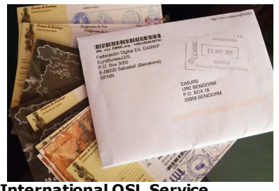
International QSL Service.